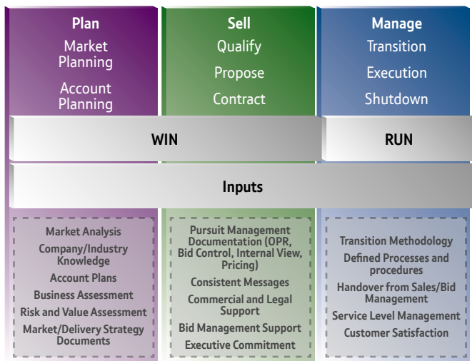
COMMAND Overall Methodology

BT Frontline offers a standardised, alternative approach to BPO. Our operating model is designed to deliver our services to our clients—better, safer, faster and cheaper. We deliver on the promise of improved efficiency and reduced cost by adhering to several key principles: